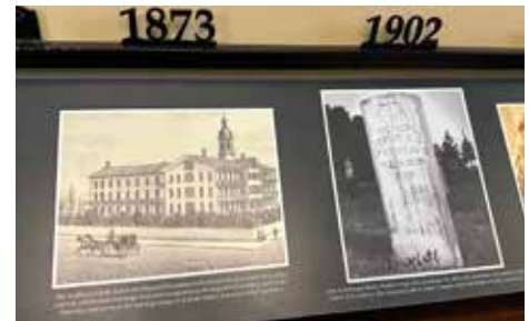
LEFT: Mayflowers found an attractive place for lunch after touring Providence Academy. ABOVE RIGHT: some kids playing in the attic at Providence Academy; BELOW RIGHT: memorabilia from days when the Academy was an orphanage and a school for girls.